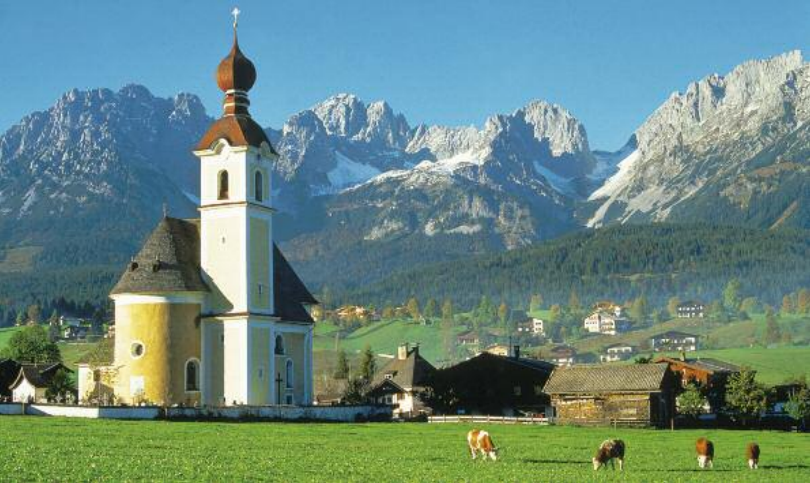
Wildler Kaiser Mountains, Tyrol